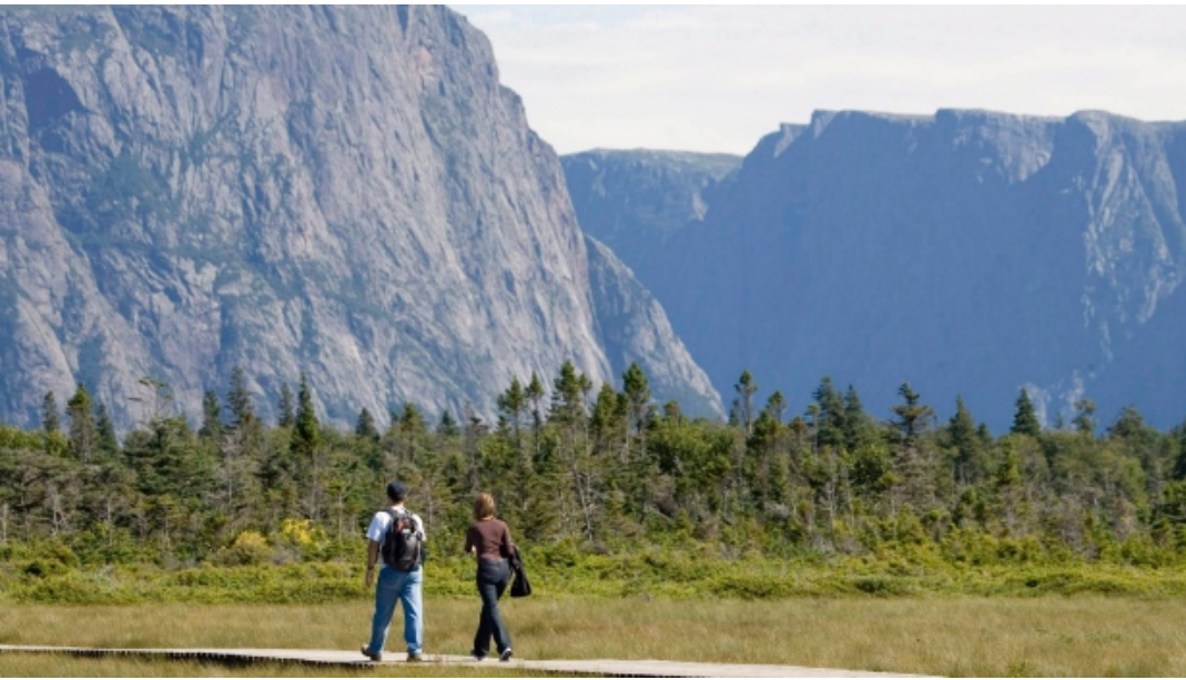
A couple walk along a boardwalk on their way to Western Brook Pond in Gros Morne, N.L., in an August 14, 2007, file photo.